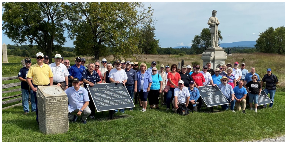
Harrisburg and Hershey CWRTs Fall 2021 Field Trip to Antietam

Market the trip aggressively and circulate flyers for the next field trip.