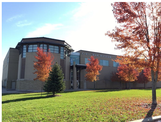
Kenosha Civil War Museum