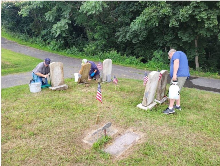
Members of the Cumberland Valley and Shippensburg CWRTs volunteer to clean and repair gravestones at the Mt. Vernon/Lebanon Cemetery.